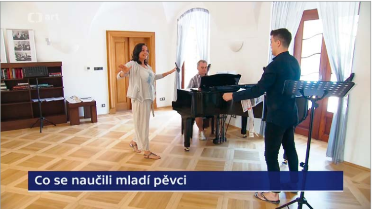
Co se naučili mladí pěvci