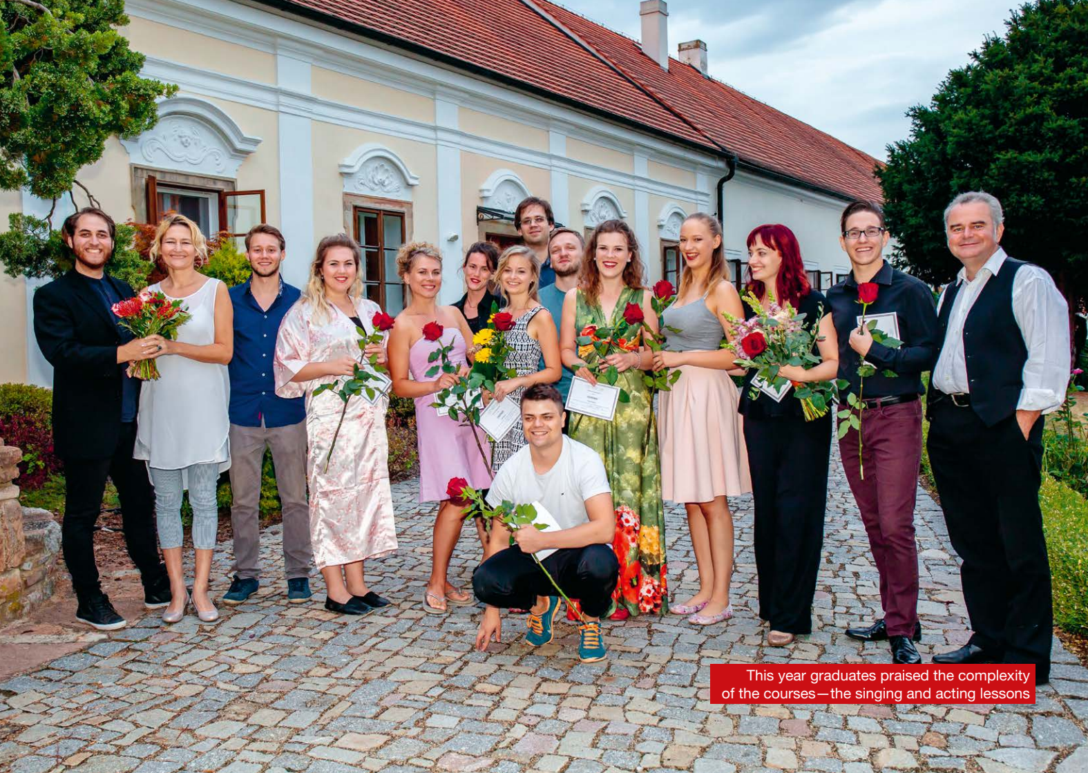
This year graduates praised the complexity of the courses—the singing and acting lessons