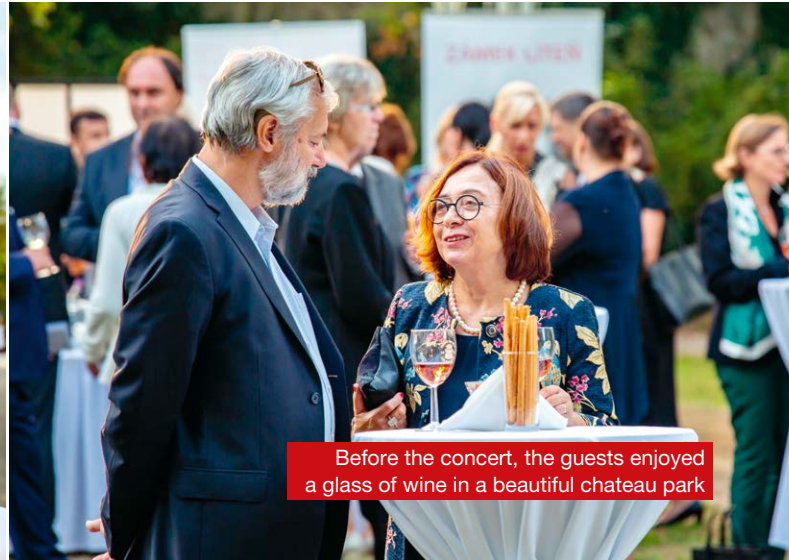
Before the concert, the guests enjoyed a glass of wine in a beautiful chateau park