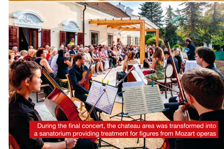
During the final concert, the chateau area was transformed into a sanatorium providing treatment for figures from Mozart operas