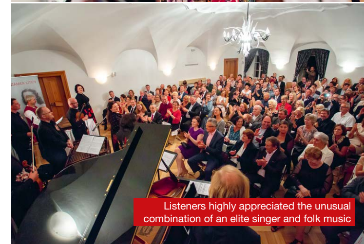
Listeners highly appreciated the unusual combination of an elite singer and folk music