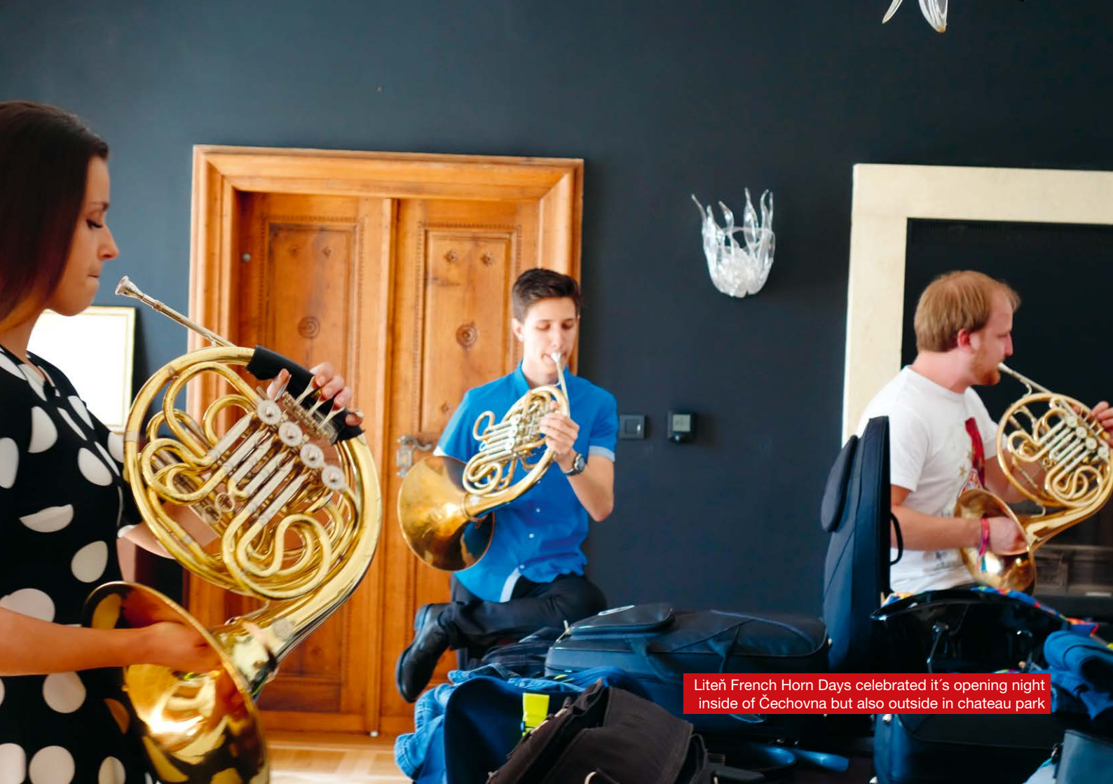
Liteň French Horn Days celebrated it's opening night inside of Čechovna but also outside in chateau park