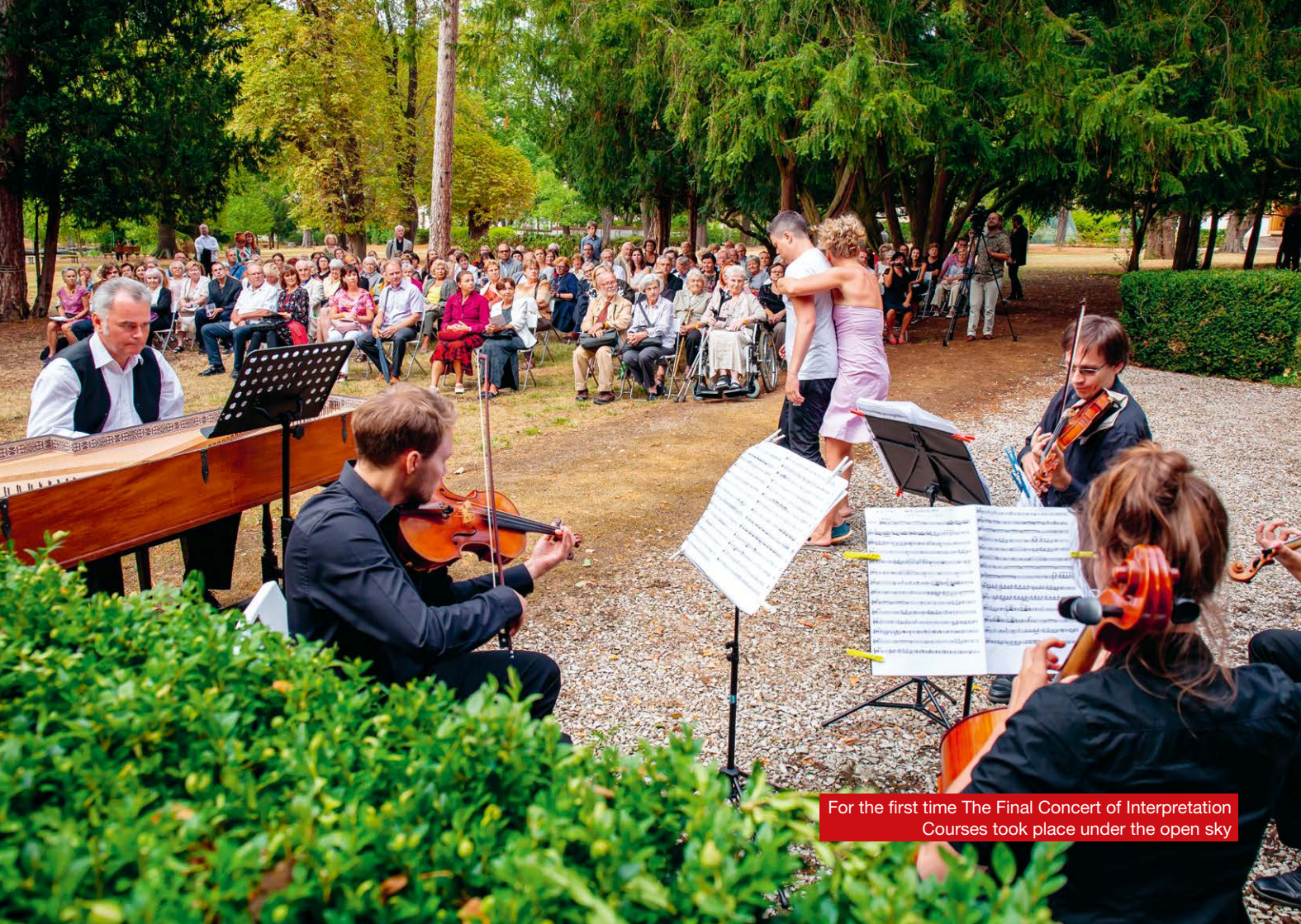
For the first time The Final Concert of Interpretation Courses took place under the open sky