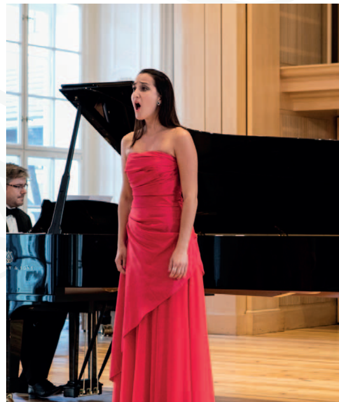
Precise piano play and representative space accompanied the excellent performance of the singers.

Among this year's specialties and new projects, a unique place belongs to the concert biennale of selected graduates of singing courses organized during last two years. This project was established to introduce the best participants of Interpretation Courses in Liteň to music professionals and to help them to start their career. The directors of the most prominent music theaters and orchestras in the Czech and Slovak Republic were invited to the concert with the title "The Best of..." . There they had a chance to listen to young and compelling voices for which they can potentially find a use within their activities.