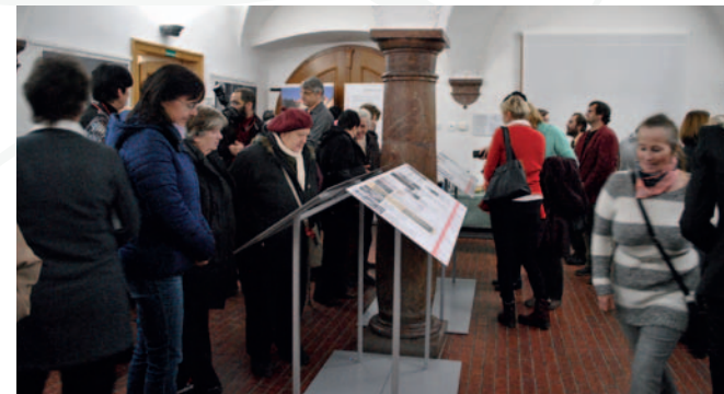
On the day of the opening, the Museum of Czech Karst in Beroun was extraordinarily busy.