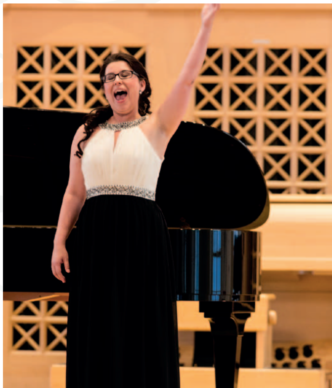
Thinking about their future career and unique auditorium in the hall, the interpreters were doing their best.