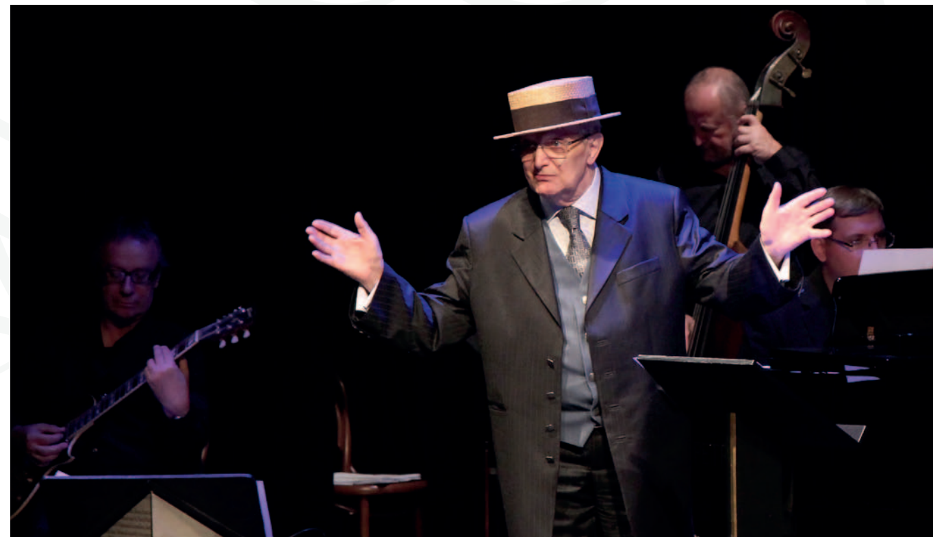
In fall 2016, Jiří Suchý celebrated his 85 th birthday, and we gave him a present in the form of a documentary about his life and work. To introduce the movie, we have organized three special events in Semafor Theater in Prague, the Czech Republic.