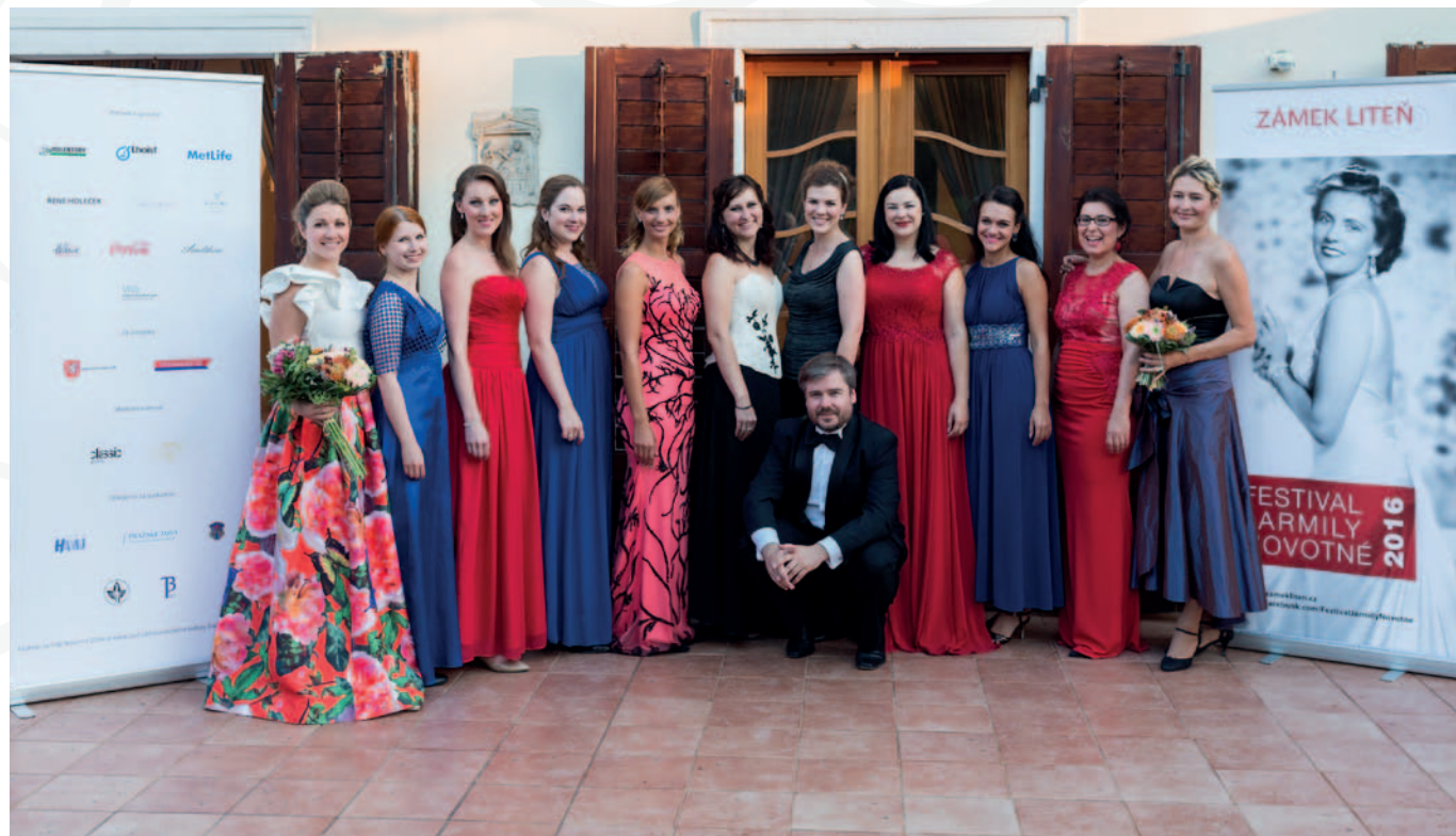
Through the three years of its existence, the singing courses became the showcase of Jarmila Novotná Festival.