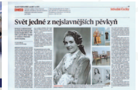
MF Dnes, February 1, 2016

"At the beginning of the event, the viewers had a chance to see the documentary Jiří Suchý: My Fights and Struggles in which the founder and head of the Semafor Theater is, on the basis of the performance called The Funniest Tragedy in the Czech Republic, mapping the nightfall of his theater. In the film, Jiří Suchý leads a discussion with God about where the inspiration and ideas come from. The documentary is made in an excellent way and the viewer has a feeling it can be twice as long."