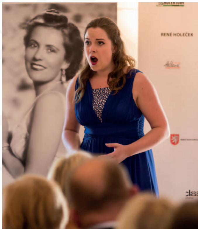
It is very probable that the direct presence of Jarmila Novotná also contributed to the excellent performance of young singers.