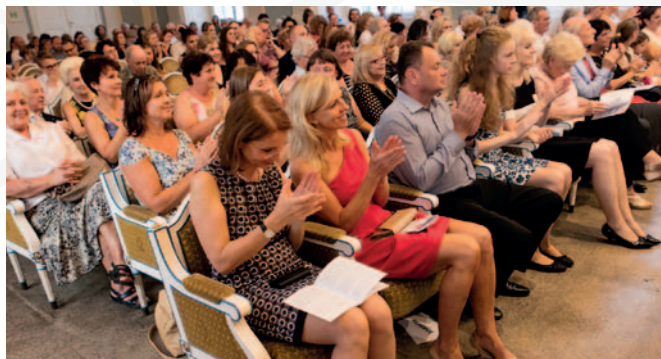
Young and talented singers were able to tune more than 200 concert visitors from all the parts of our country.