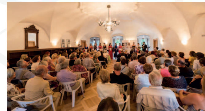
The special atmosphere of this year concert was created also thanks to guests. The hall of Čechovna was after a year again full to bursting.

The courses were enriched by lectures on Jarmila Novotná, her life story, her career as a singer and a film star, her connection to Liteň, and about the importance of her legacy for today's world. Participants had time for relax and recreation activities in the company of their lecturers in the impressive environment of Chateau area with a large park.