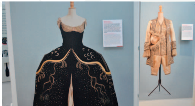
Opera costumes decorated with hand-made embroidery and other ornaments look very attractive even on pictures.