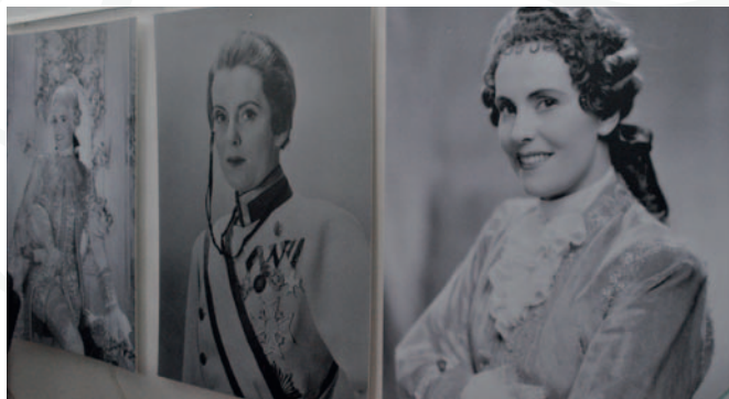
The portraits of Jarmila Novotná became one of the dominant features of the exhibition area at the Museum of Czech Karst in Beroun.