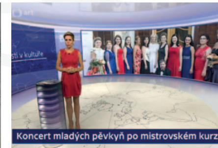
ČT art, September 15, 2016