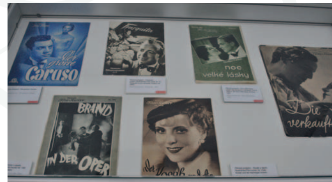
The historical artifacts from the museum collection of Chateau Liteň put the finishing touch to the overview of the life and artwork of the famous diva.

The first stop took place at the Museum of Czech Karst in Beroun – it was the leading exposition for three months there, and because of great interest, it was prolonged almost by a month. During summer holidays, the exhibition moved to the exhibition space of the birth house of Gustav Mahler in the village Kaliště near Humpolec, where it was accompanying the program of the Mahler-Jihlava Festival called The Music of Thousands. In spring 2017, it will move to the Senate of the Czech Republic. Our goal is to present this project gradually in galleries and museums throughout the Czech Republic and potentially also abroad.