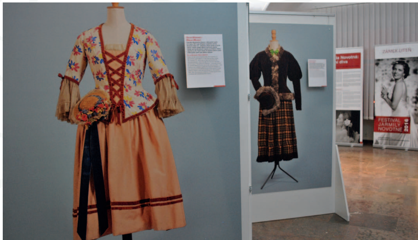
The most famous costumes in which Jarmila Novotná conquered the world, were depicted on large-format pictures that formed the basis for the touring exhibition about her life.