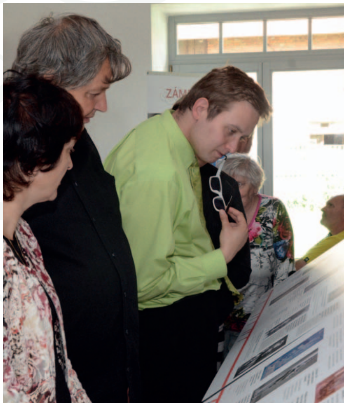
Visitors of the exposition in the birth house of Gustav Mahler were interested in life and career of Jarmila Novotná too.