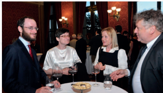
The concert was followed by the meeting with supporters of Chateau Liteň and Jarmila Novotná Festival that took place in the lounge of Rudolfinum.