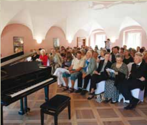
Listeners in Čechovna.