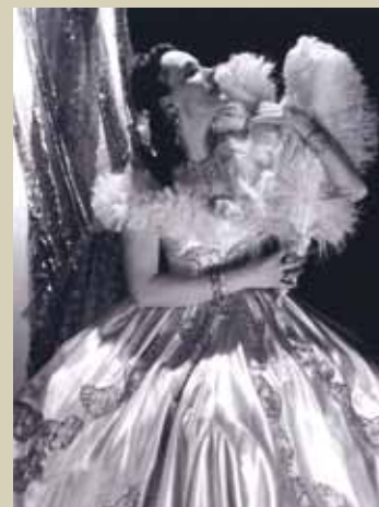
Jarmila Novotná Festival – 1st season