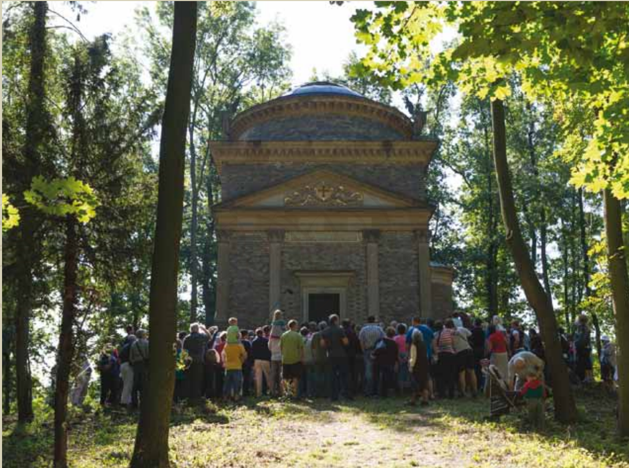
The official opening of the Festival.