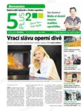
5 plus 2, 9/25/2015