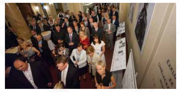
Hundreds of visitors crowded the foyer of Municipal House in Prague.

The exhibition was organized in the cooperation with the Metropolitan Opera in New York, the National Gallery in Prague, and Municipal House in Prague.