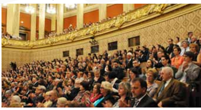
Rising stars together with their "host" were able to sell completely out Dvořák Hall in Rudolfinum.