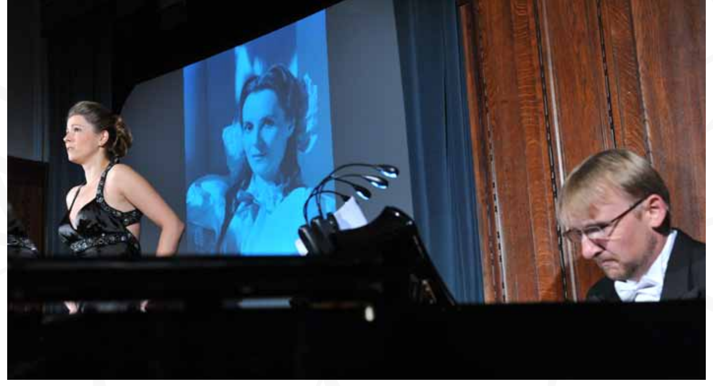
Maybe the same atmosphere full of emotions and tenderness created by Kateřina Kněžíková was typical for the performances of Jarmila Novotná.