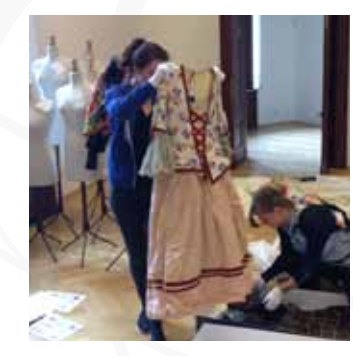
Costumes from the Metropolitan Opera counts for artworks, and that is why it is necessary – literally – to treat them with kid gloves.