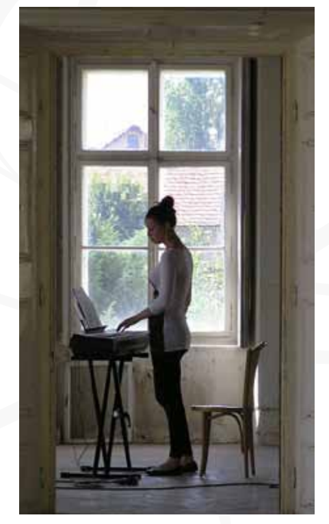
Interiors of the Chateau provided the participants with the place for rehearsals and concentration.