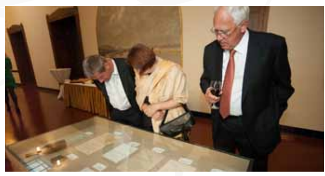
The exhibition also consisted of the museum collection of Jarmila Novotná and the Daubek family that was very attractive to visitors.