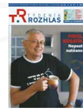
Týdeník Rozhlas, 9/21/2015