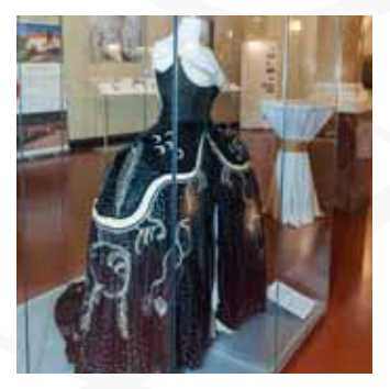
The most beautiful of all is probably the costume for the role of Violetta made in fashion house of Hana Podolská.