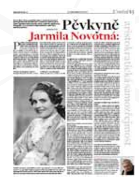
Literární noviny, 9/10/2015

Links to media outputs are available at www.zamekliten.cz.