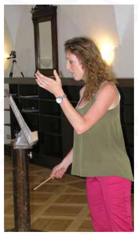
Čechovna became the main place for the master class.