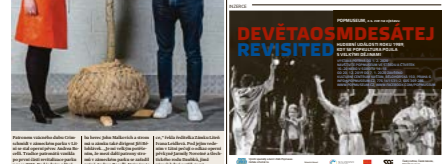
Andrea Bocelli s certifikátem a obilím.

Andrea Bocelli má v Liteň svítit dub. Tenorista se bude účastnit koncertu, který se uskuteční v rámci festivalu Jarmila Novotná. Bocelli je známý svými krásnými hlasy a jeho vystoupení jsou vždy velkým zážitkem pro publikum. Koncert bude probíhat v krásném prostředí festivalového areálu, kde se každoročně uskutečňují různé kulturní akce.