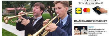
Umělecký soubor při koncertu.

Zámek Liteň ožil uměním IV. ročníku ZUŠ Open. V rámci festivalu Jarmila Novotná se uskutečnil koncert, který byl velkým úspěchem. Účastníci z různých území předvedli své dovednosti a talent. Koncert byl velmi příjemný a diváci si ho velmi užili.